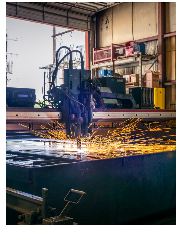
Advanced manufacturing is prominent in Seguin, with many relying on the use of innovative technology to improve production and processes.