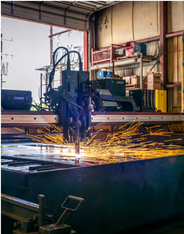
Advanced manufacturing is prominent in Seguin, with many relying on the use of innovative technology to improve production and processes.

Manufacturing is the heart of the Seguin economy. Numerous manufacturers and FORTUNE 500 manufacturing companies have established major operations within the City of Seguin. This includes Vitesco Technologies, Commercial Metals Corporation (CMC), Tyson Foods, Inc., Caterpillar, Inc., Minigrip, Alamo Group, Georgia Pacific and Hexcel.