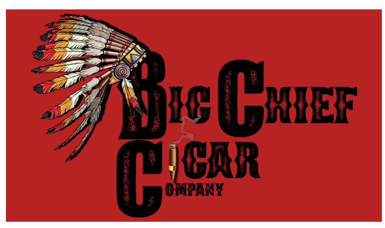
111 N Austin St, Seguin, TX https://www.facebook.com/BigChiefCigarCompany