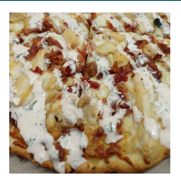
David's Pizzeria 755 South Guadalupe Street