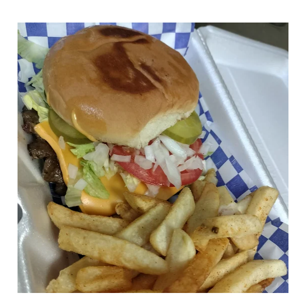
Billy Joe's Burger & More 1511 N Austin Street