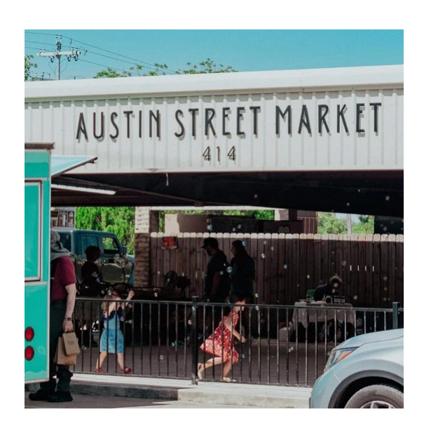
Austin Street Market 414 North Austin Street