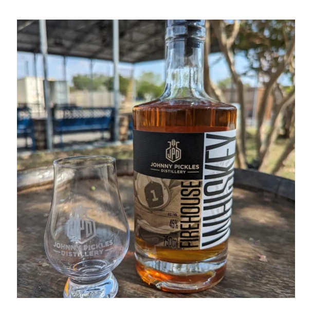
Johnny Pickles Distillery 1711 North Austin Street